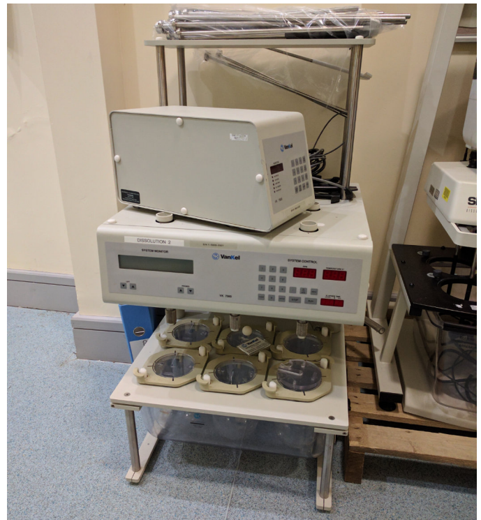
Dissolution System taking up valuable space in the Pharmacy Department